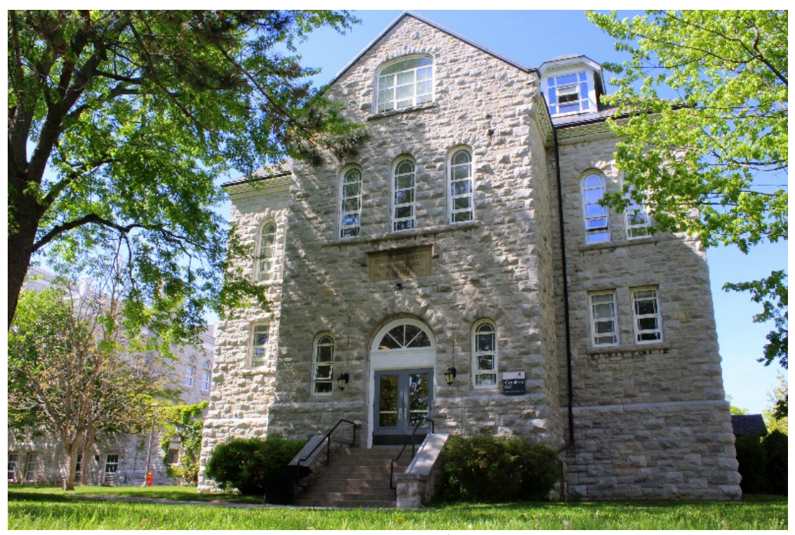
Carruthers Hall, Queen's University

Established in 1968, the Department of Public Health Sciences (formerly Community Health and Epidemiology) was created to study the incidence of diseases in Canadian communities and to find ways to help reduce public health risk. Since then, the fields of community health and epidemiology have broadened considerably. Department members now conduct research and teach in areas as diverse as health economics, mental health, program evaluation, and biostatistics. The Departmental offices are in Carruthers Hall at the center of the Queen's campus.